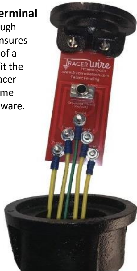
*TracerPit® All-Duty fixture sold separately